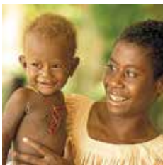
The Anitua Group is supporting a plan to eliminate Malaria from the Lihir Islands.