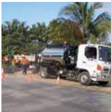
Dedicated road sealing teams provide complete services for large or small bitumen projects.

With safety as our number one priority, we are specialists in the field of Mining. Our specialist knowledge, expertise and flexible service will ensure the delivery of timely, cost-effective and quality results.