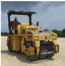
The dedicated road sealing team is able to complete any large or small bitumen project.

Our specialist knowledge and skills makes a difference, with a breadth of construction and mining expertise