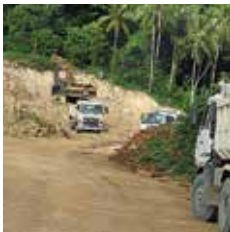
Coronus quarry operation provides material for road construction.

A support team that brings you operational efficiencies from day one