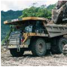
Anitua Mining Services has contracts in place for the movement of up to 20 million cubic metres of material.